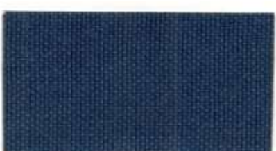
JU-118 - DENIM