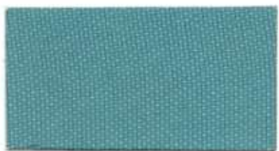
JU-136 - OCEAN BLUE