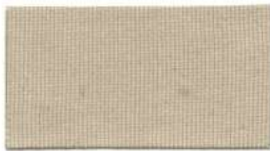
JU-125 - SAND