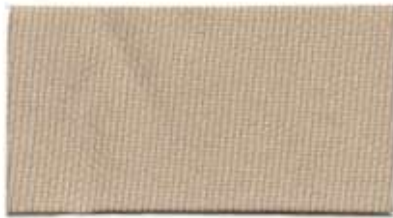
JU-126 - DRY ACORN