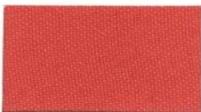
JU-108 - GLOWING RUST