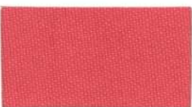
JU-110 - RASPBERRY