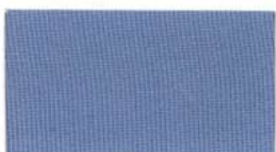
JU-116 - ICE CUBE