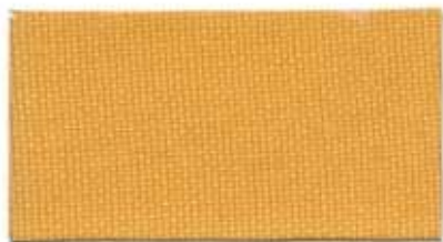
JU-135 - YELLOW