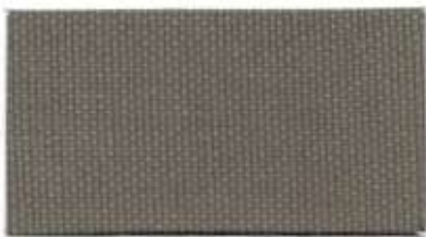
JU-122 - GRANADA