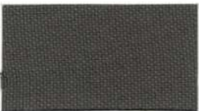
JU-123 - GUNGREY