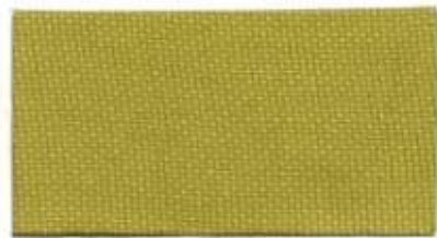
JU-134 - FOREST