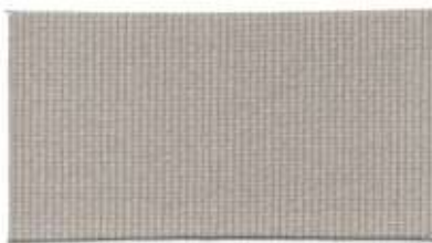
JU-119 - MINK