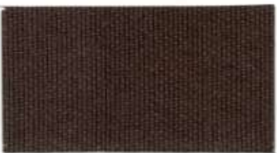
JU-130 - BROWN