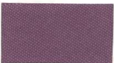
JU-105 - HAZEL NUT