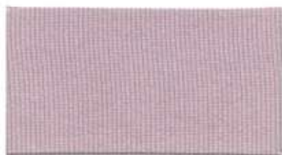
JU-102 - BUFF