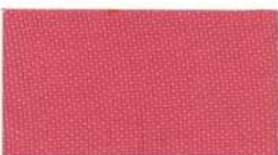
JU-109 - BLUSH