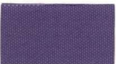
JU-106 - PURPLE