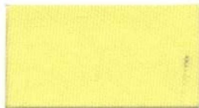
JU-133 - MEDAL