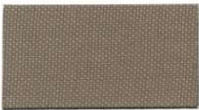
JU-128 - BRAVO