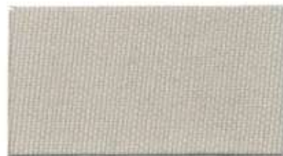
JU-113 - CLOUD