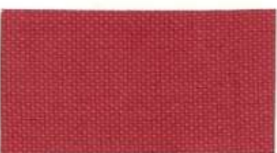
JU-111 - SCARLET