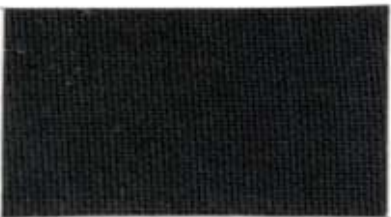
JU-124 - BLACK