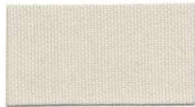
JU-131 - CLEAR SKY