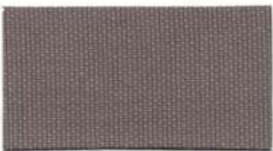
JU-129 - APRICOT