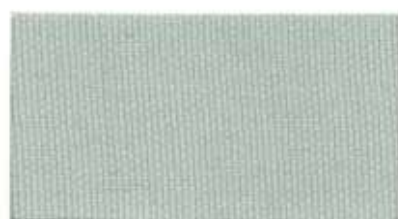
JU-114 - GREY TINT