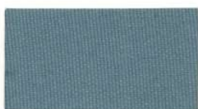
JU-115 - OCEAN