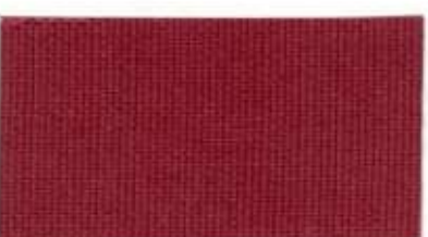
JU-112 - TANGERINE