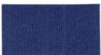
JU-117 - NAVY BLUE