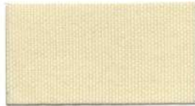
JU-132 - PALE LIME