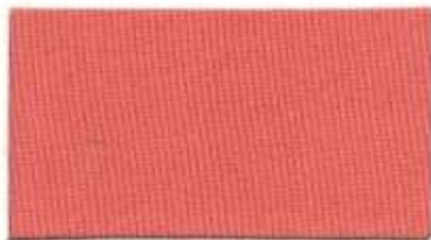
JU-107 - ORANGE VISION