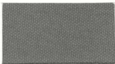
JU-121 - GREYSTONE