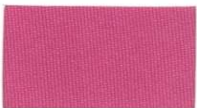
JU-104 - MARTINI