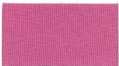
JU-103 - SILVER PLUM