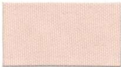
JU-101 - PEARL