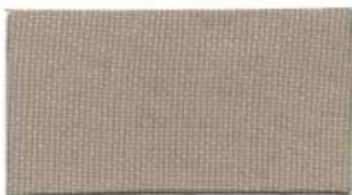
JU-127 - ACORN