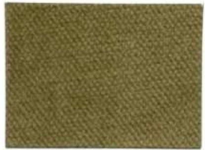
AE-112 ORGANIC GREEN