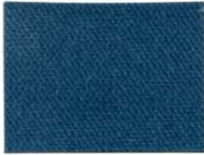
AE-122 MIDNIGHT BLUE