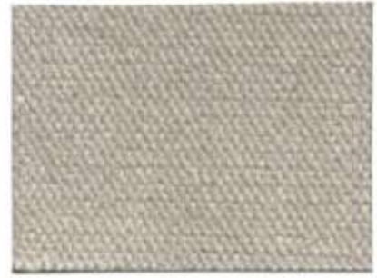
AE-127 ICE GREY