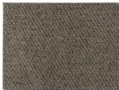
AE-124 SIDE PARK