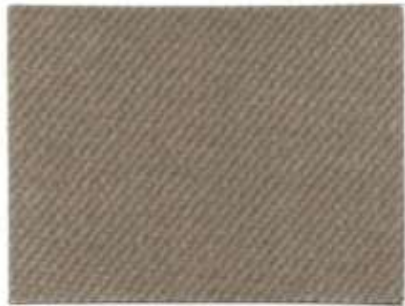
AE-117 DRY ACRON