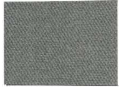
AE-128 ELEGANT GREY