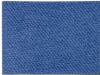
AE-123 MED BLUE