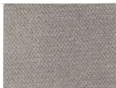
AE-120 ASH GREY