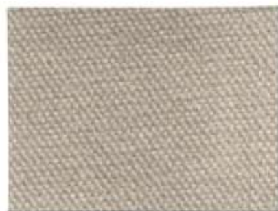
AE-119 GREY TINT