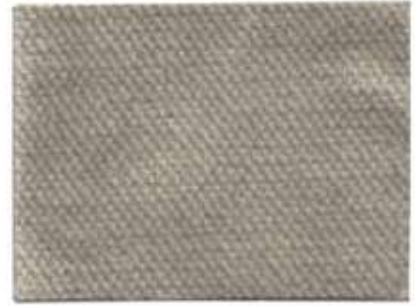
AE-126 CLEAR SKY