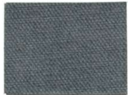
AE-129 STONE CASTLE