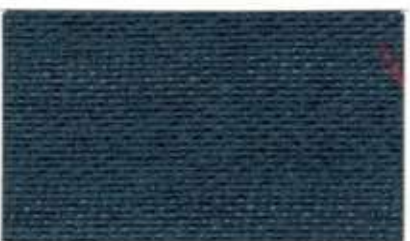
BL-109 NAVY BLUE