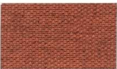
BL-141 BURNT ORANGE