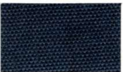
BL-111 MIDNIGHT BLUE