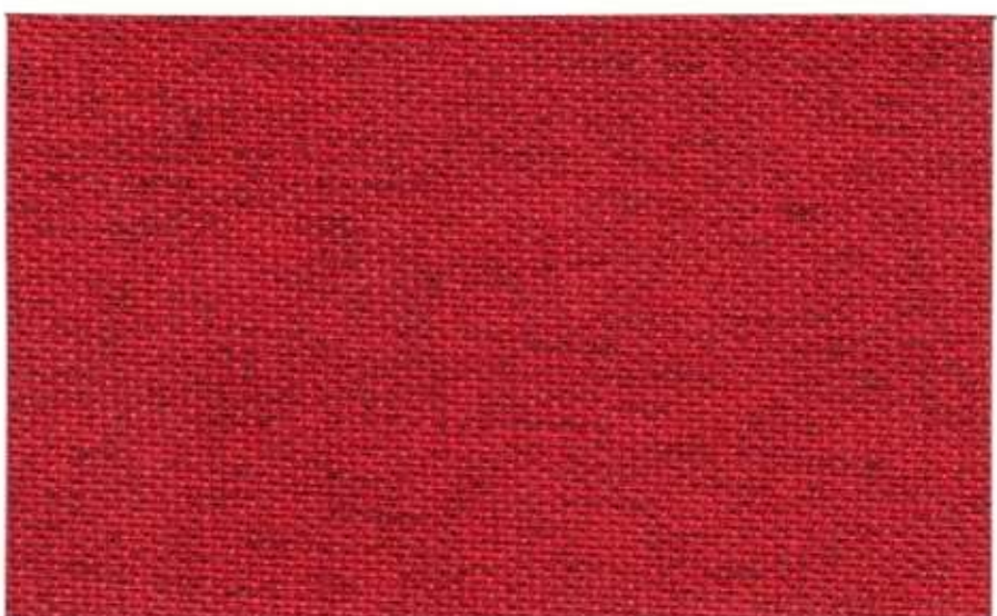
BL-206 FLAME RED