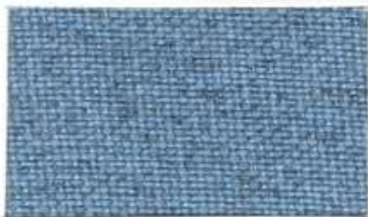
BL-105 MED BLUE